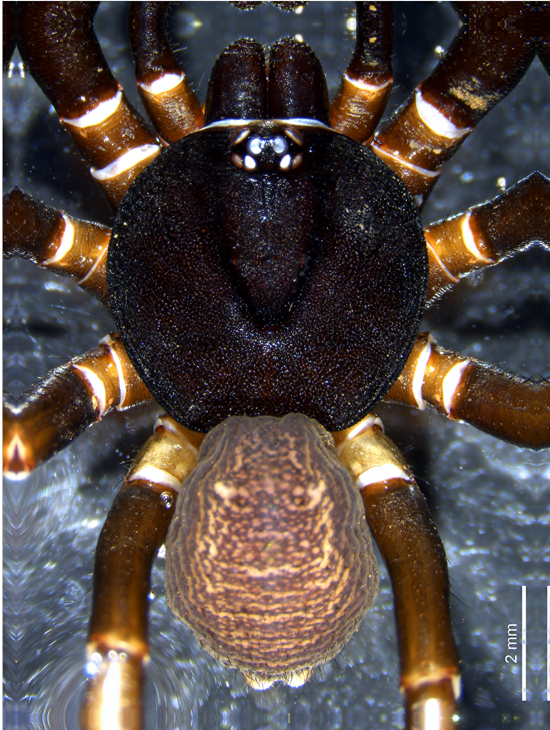
Figure 2. Conothele purvaghati sp. nov. holotype male NCBS AU701 showing carapace and abdomen. Scale bar 2mm.

Sternum: 2.99 long, 2.80 wide. Glossy, covered sparsely with short black bristles. Sigilla indistinct.