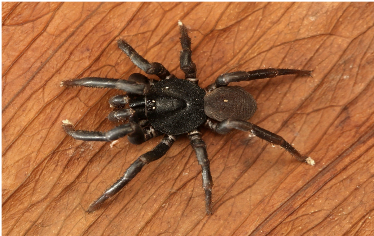
Figure 1. Conothele purvaghati sp. nov. holotype male NCBS AU701 in life.

Description of male holotype NCBS AU701 (Fig. 1): The specimen is in good condition but with left pedipalp and chelicerae dissected. Total length 8.15. Carapace 4.45 long, 4.75 wide. Fovea 0.64 wide, distance from anterior border 5.62. Abdomen 3.7 long, 2.8 wide. Spinnerets: PMS, length 0.43, midwidth 0.19, apart 0.1; PLS, total length 0.74 (0.34 basal, 0.30 middle, 0.10 apical; midwidths 0.6, 0.4, 0.1 respectively), 0.55 apart.